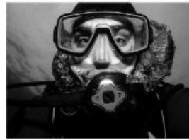
1 diving instructor

city diving instructor painter photographer van yard