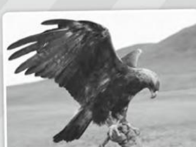
Gerty the Golden eagle

Meet our flying friends! Harry 1 is the biggest eagle here. He measures 105 cm. But Gerty's wings 2 _____ Harry's wings at 2 m long. Gerty can fly at 241 km/h. She 3 _____ eagle. Harry 4 _____ at catching food! His beak 5 _____ Charlie's and Gerty's – he can carry animals like sloths! Can you hear that noise? That's Charlie! He 6 _____ Harry and Gerty. We think Harry 7 _____ eagle because the feathers on his head are amazing! Which eagle would you like to learn more about? Which one do you think 8 _____ — Harry, Charlie or Gerty?