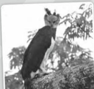
Harry the Harpy eagle

interesting big noisy fast beautiful strong good long