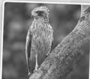
Charlie the Crested Serpent eagle