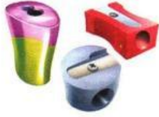
6. pencil sharpeners