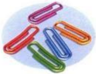
1. paper clips