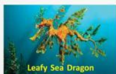
Leafy Sea Dragon