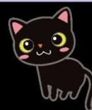
A BLACK CAT