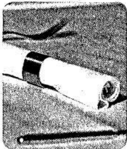
7 n _ _ k _ _