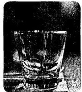
10 g _ _ _ s