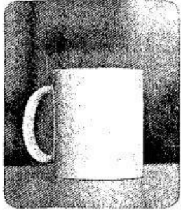
1 m _ u _ g