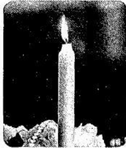
3 c _ _ d _ _