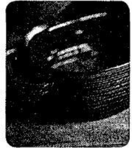
5 s _ _ _ v _ _ g d _ _ h