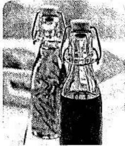
2 o _ _ _ and v _ n _ g _ _