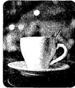
4 c _ _ _