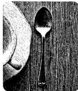
9 t _ _ s _ _ _ n