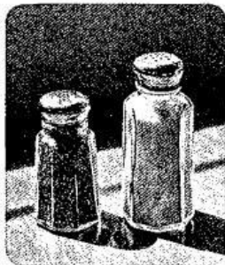
8 s _ _ t and p _ _ p _ _