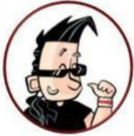
a. Mr. Star

This character has got long, straight, black hair. Who is it?