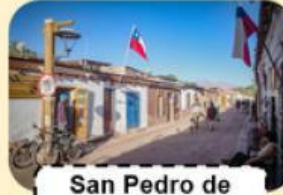
San Pedro de Atacama