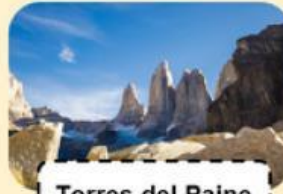
Torres del Paine

tourist – place – visit – popular – city – mountain – desert