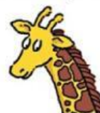
7 a / an giraffe