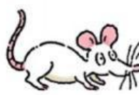
5 a / an mouse