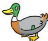
4 a / an duck