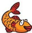
2 a / an fish