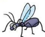
1 a / an insect