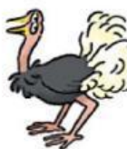
3 a / an ostrich