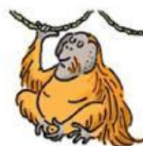
6 a / an orang-utan