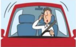
1 I can't talk now. I . (drive)