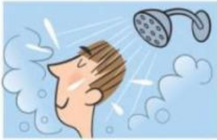
He 's taking a shower. (have)