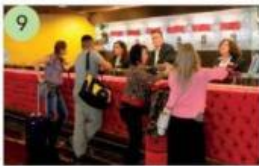
9 arrive at a hotel /ə'raɪv æt ə hoo'tel/ (in a city)