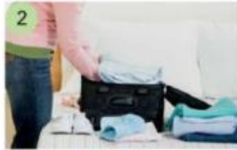
2 pack a suitcase /pæk ə 'su:tkeɪs/