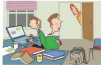
5 We for an exam. (study)