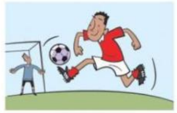
4 He soccer. (play)