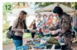
12 buy presents /baɪ 'preznts/