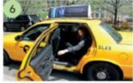
6 get a taxi (a train, a bus) /get ə 'tæksi/