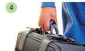
4 carry a suitcase /'kæri ə 'su:tkeɪs/