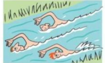
6 They in the river. (swim)