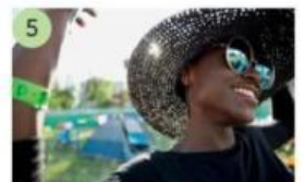
5 wear sunglasses /weɪ 'sʌŋglæsəz/