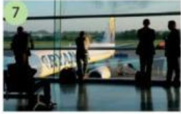
7 wait for a flight /weɪt fər ə flaɪt/