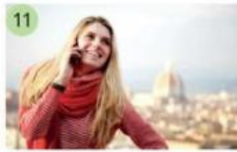
11 call home /kɔːl hoʊm/