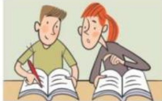
2 You the wrong exercise! (do)