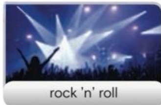
rock 'n' roll