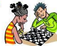
6 play ...