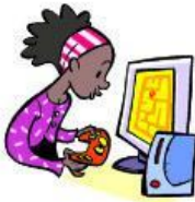
1 play computer ...