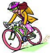
8 ride a ...