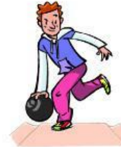
4 go ...