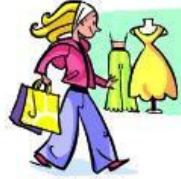
3 go ...