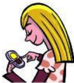
9 send ... messages