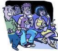
7 go to the ...