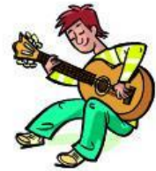
5 play the ...