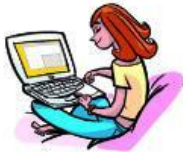
10 ... the Internet