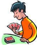
2 play ...