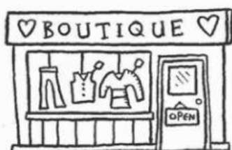
4 a store