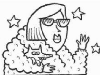
5 a famous actor