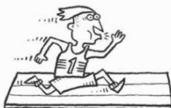
7 an athlete