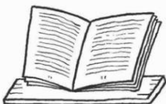
9 a book