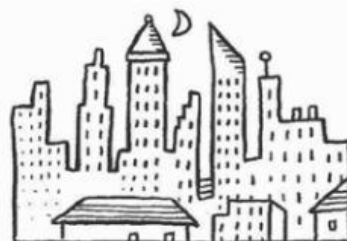
8 a city