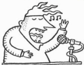
1 a singer