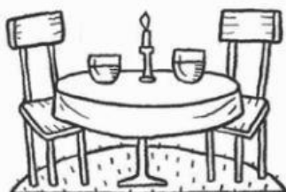
2 a restaurant