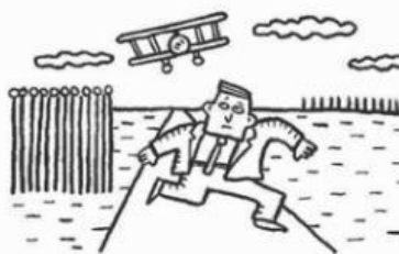
10 a classic movie