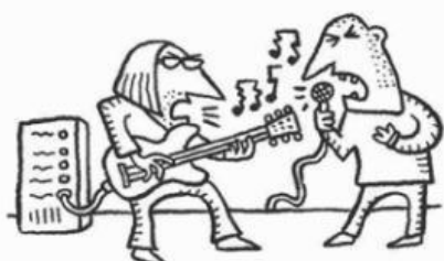
6 a band