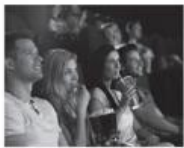
1 a cinema

an art gallery a cinema a classical music concert a dance lesson a film/movie an instrument a painting lesson a play a salsa class