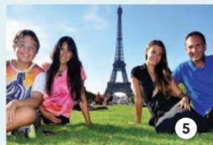
Paris, France – August 2015