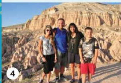
Cappadocia, Turkey – October 2014