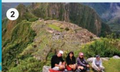
Machu Picchu, Peru – March 2013

Yes, I love every day! It's never boring!