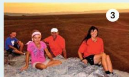
Nazca, Peru – March 2013