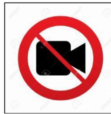
Camera off Turn off your camera