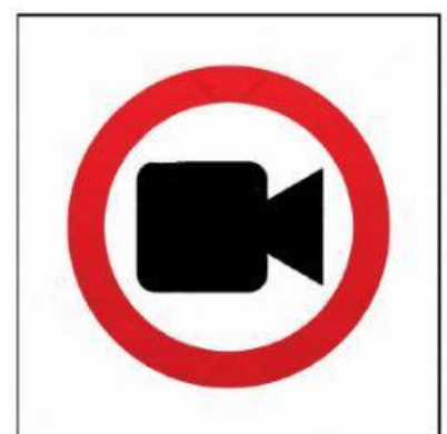
Camera on Turn on your camera