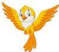
13. Bi ____ d