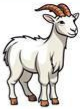
5. G ____ at