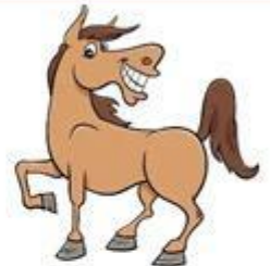
16. Ho ____ se