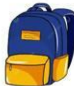
11. ____ ag