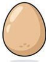
2. E ____ g