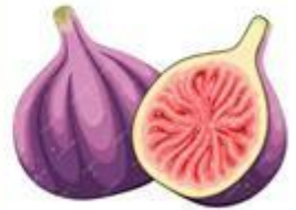
8. f ____ g