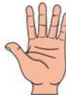
15. ha ____ d