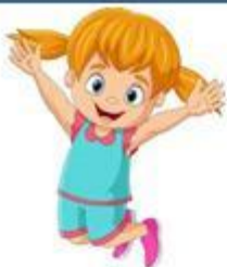
9. Gi ____ l