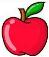
1. A ____ ple