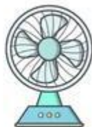
14. f ____ n