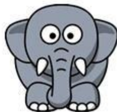
10. El ____ phant