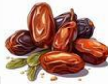
3. D ____ te