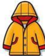
7. C ____ at