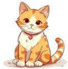
4. Ca ____