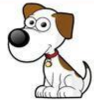
12. Do ____