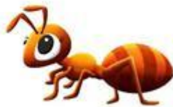
6. ____ nt