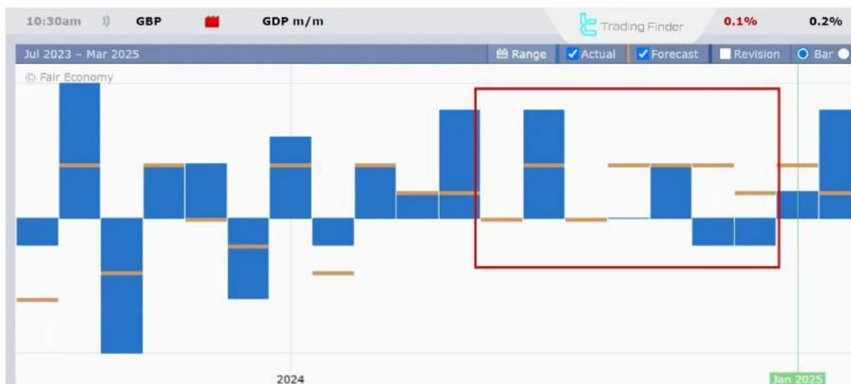
Decline in UK GDP in H2 2024 due to sharp tax increases

High taxes or reduced government spending also increase producers' costs and lower consumer demand, exacerbating stagflation.