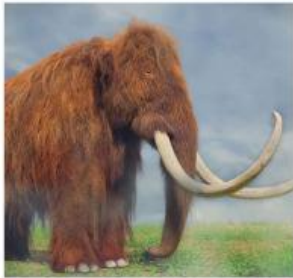
1 woolly mammoth

axe berries flint hunt gather weapons woolly mammoth