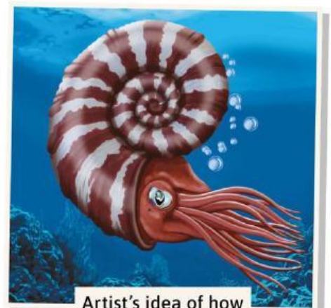
Artist's idea of how ammonites looked