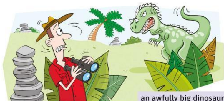
an awfully big dinosaur

There are different ways of spelling the or sound.