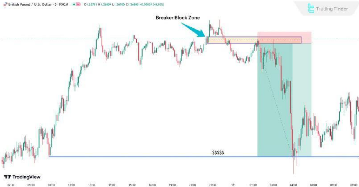
A Bearish Breaker Block on GBP/USD price chart

Now, let's define trade parameters for both bullish and bearish setups: