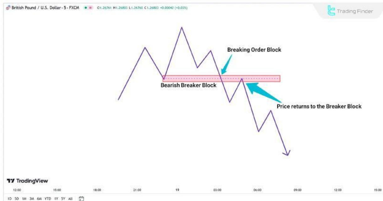
General schematic of a Bearish Breaker Block (ICT Breaker Block)

A bullish Order Block (OB+) is broken by a downward price movement. After the break, it shifts to act as a resistance zone, aiding further price decreases.