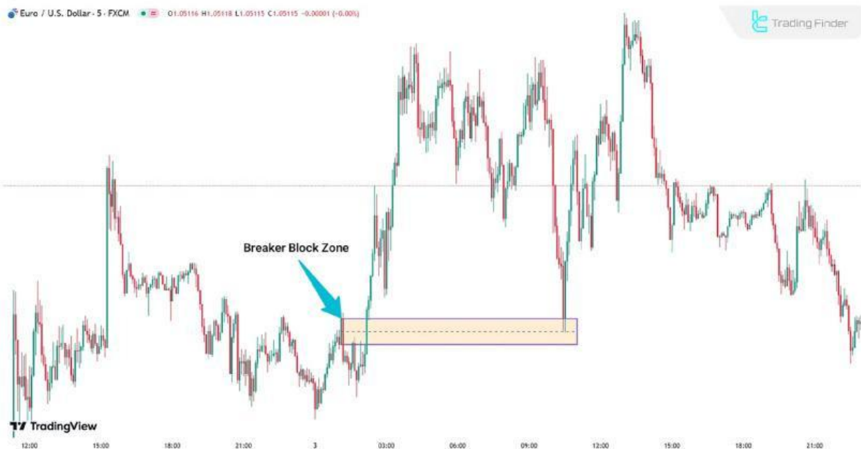
A Bullish Breaker Block trade with entry, stop-loss, and take-profit levels