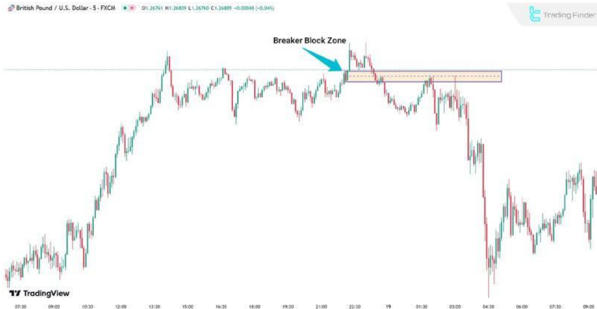
A Bullish Breaker Block on GBP/USD price chart (ICT Breaker Block)

Once the Breaker Block area forms, wait for the price to retrace to this zone and enter the trade with MSS or CHoCH confirmation signals.