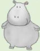
a h _ _ _ _ _