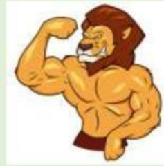
a s _ _ _ _ _