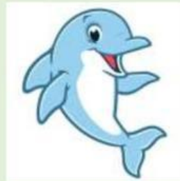
a c _ _ _ _ _