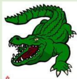
a s _ _ _ y _ _ _ _ _