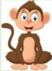
a funny monkey

Look and write. (Dbajte na malé/velké písmena, kde je potřebné - kukni na příklad.)