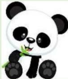
a c _ _ _ _ _