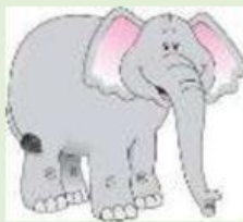
a b _ _ _ _ _