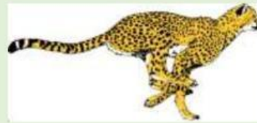
a f _ _ _ _ _