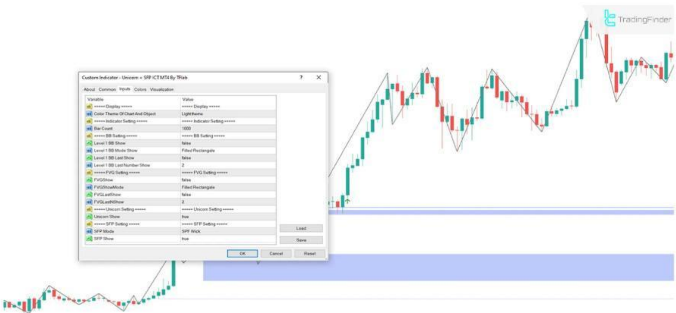
Review of Unicorn and Swing Failure Pattern Indicator Settings

Users can use this section to customize the functionality of the tool: