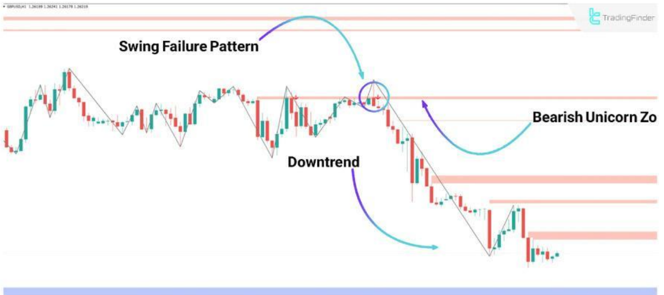
Analysis of GBP/USD Downtrend

In this case, the indicator marks the pattern with a red arrow .