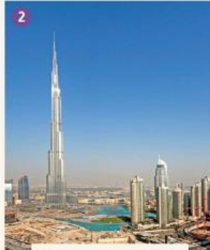
The Burj Khalifa in Dubai