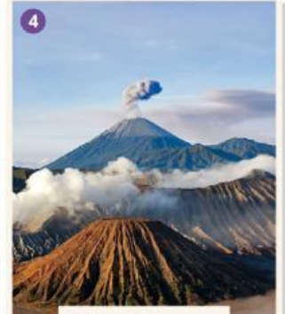
Mount Bromo in Indonesia

1 They're beautiful. I'd love to go there.