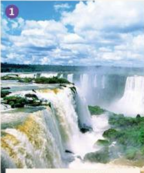
The Iguazu Falls in Brazil and Argentina