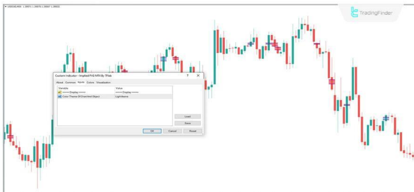
Implied Fair Value Gap (Implied FVG) Indicator Settings