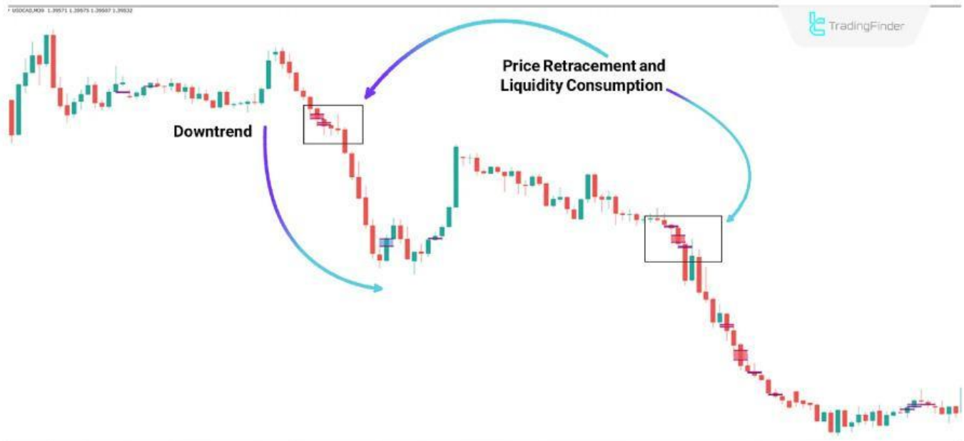
Functionality of the Implied Fair Value Gap (Implied FVG) Indicator in a Downtrend

The image shows that the price becomes bearish after penetrating the "Implied FVG" and consuming liquidity .