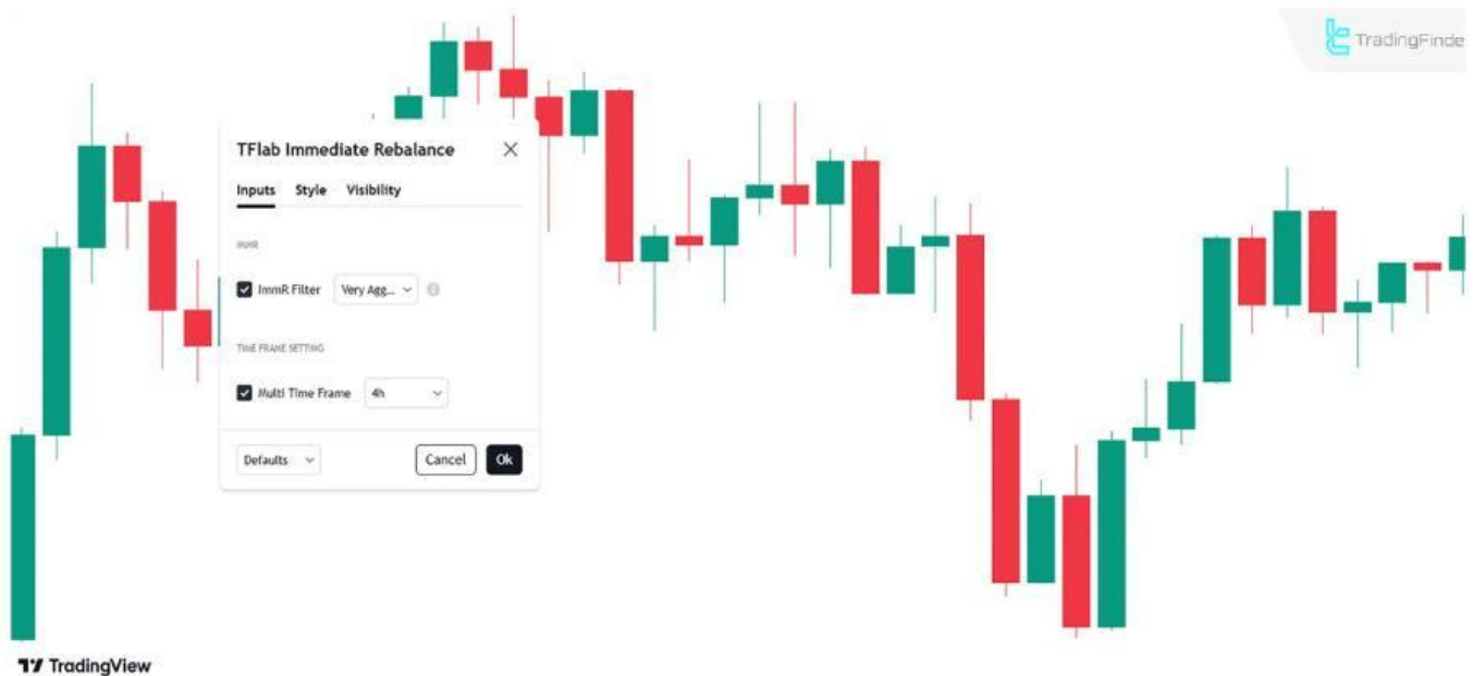
Immediate Rebalance Indicator Settings