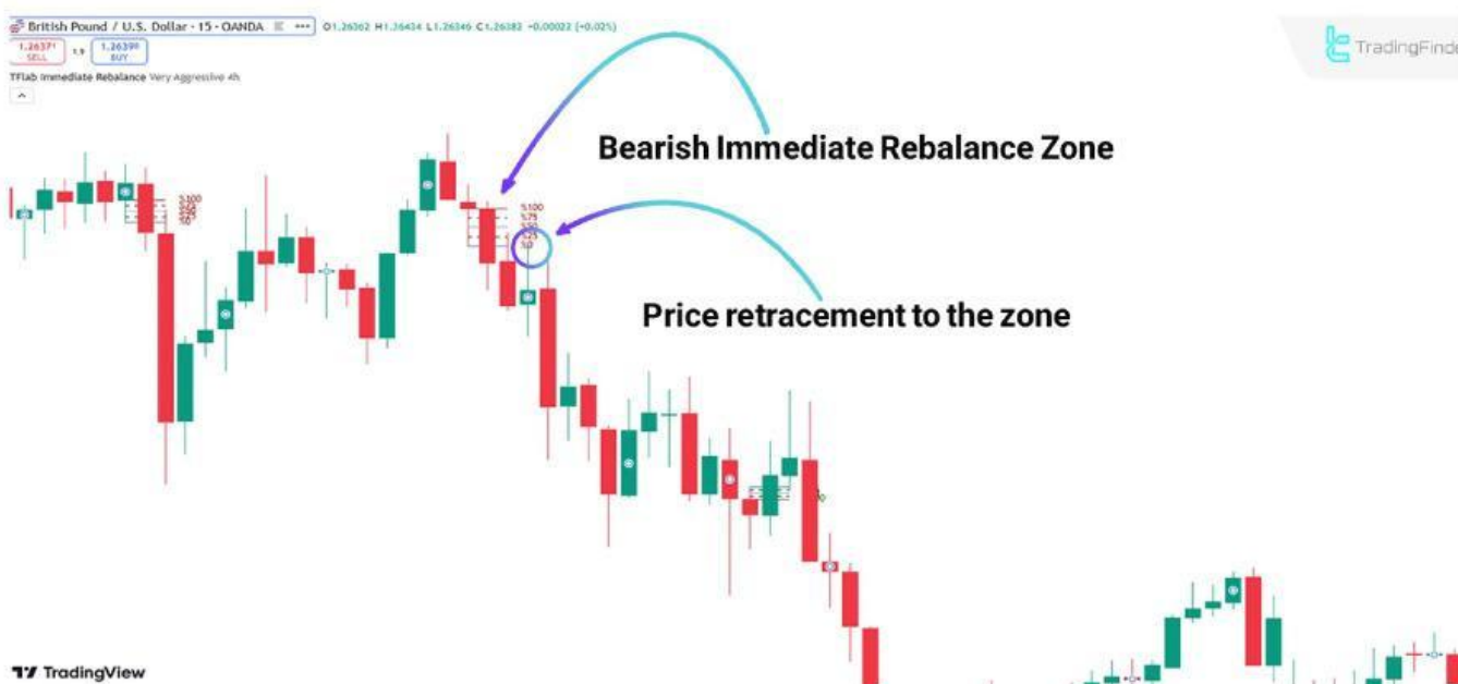
Indicator Performance in Bearish Trends

In such conditions, the return of the price to the Immediate Rebalance zone presents an excellent opportunity for Short (Sell) trades.