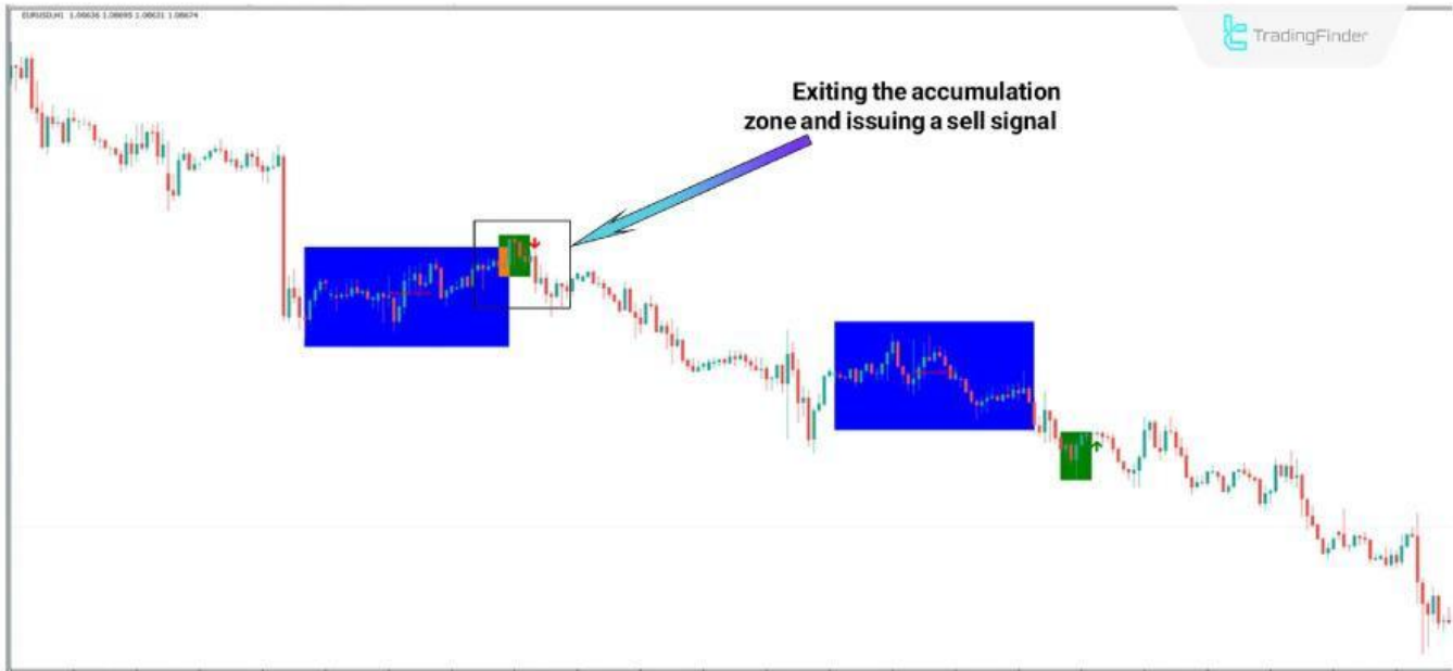
Power of Three Indicators on the EUR/USD Price Chart

This signal is in the direction of the main price trend and is issued after the price exits the green manipulation range.