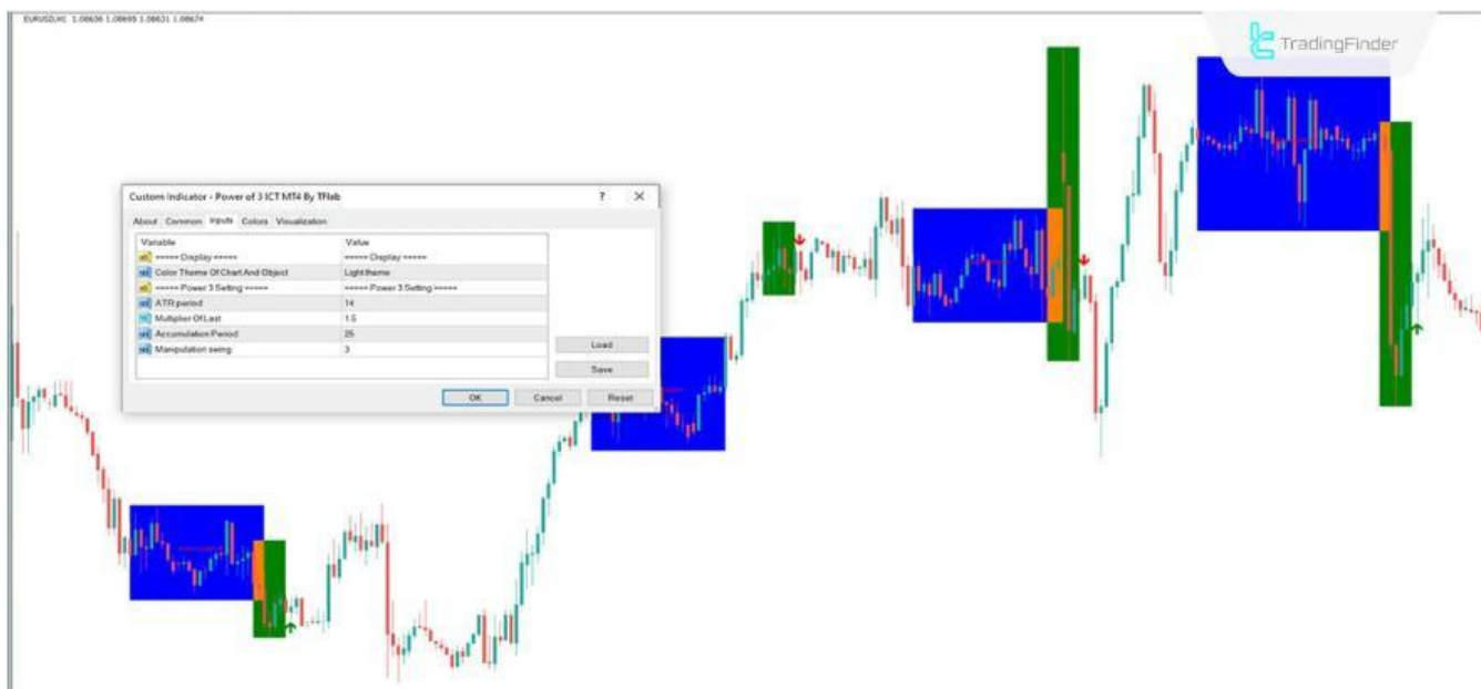
Power of Three Indicator Settings