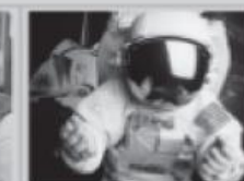
c an astronaut

Find out an interesting fact about dangerous jobs.