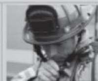
b a firefighter