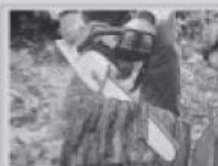
a a lumberjack (a person who cuts down trees)

What is the most dangerous job in the world?