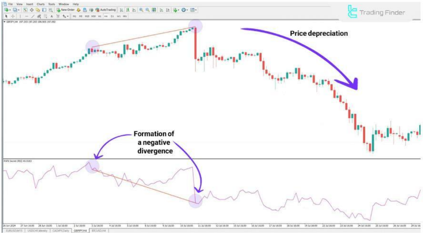
GBP/JPY Currency Pair in the 4-Hour Timeframe

This scenario may indicate a weakness in the bullish trend, and traders might consider this a potential sell signal , depending on their strategies.