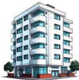
11 F ___ a ___