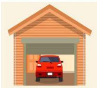
10 G ___ rag ___