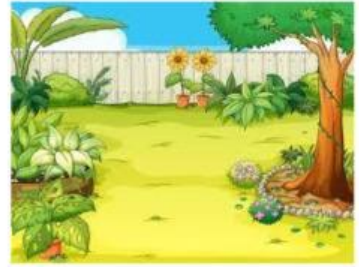
3 G ___ rd ___ n