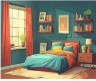
1 B ___ dr ___ om