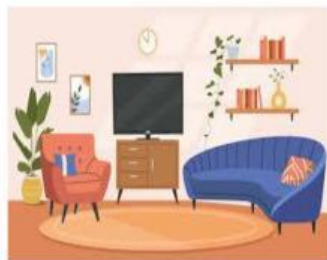
5 L ___ ving room