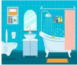
2 B ___ throo ___