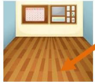
6 F ___ oo ___