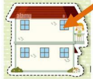
9 U ___ stair ___