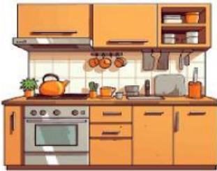
4 K ___ t ___ hen