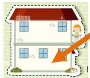
12 Do ___ nstair ___