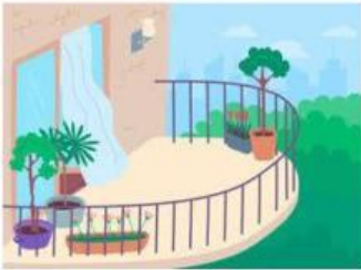
7 Bal ___ on ___