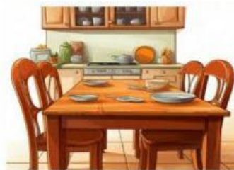
8 Di ___ i ___ g room