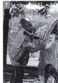
wash the car