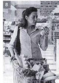
go grocery shopping