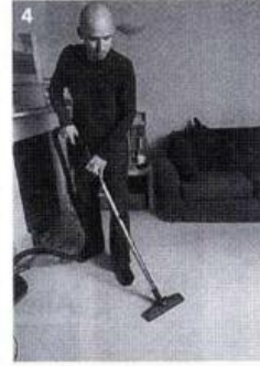
clean the house