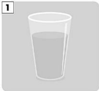
a glass of orange juice