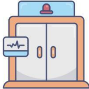
Emergency room E.R