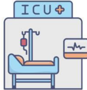
Intensive care unit I.C.U.