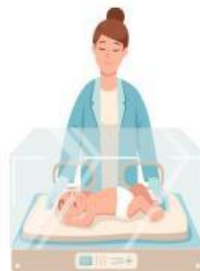
Neonatal Intensive Care Unit