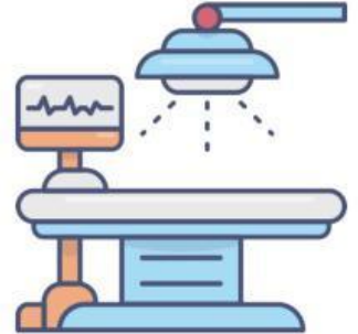
Operating room O.R.