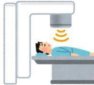
X ray room