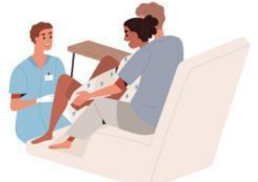
Labor and delivery room