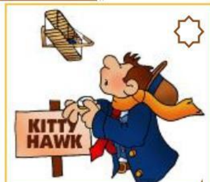
THE WRIGHT BROTHERS