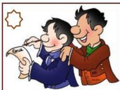
THE GRIMM BROTHERS