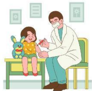
Give an injection