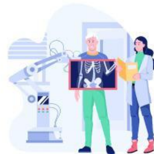
Take an X-Ray