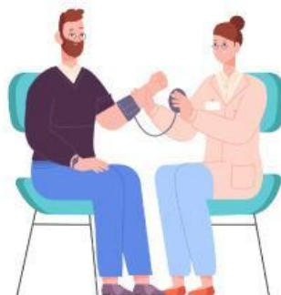
Check the blood pressure