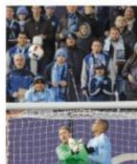
17 _____ soccer