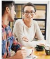
3 go out for _____