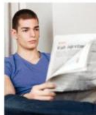
11 _____ the newspaper