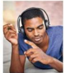
6 _____ to music