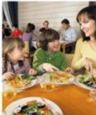
2 go out for _____