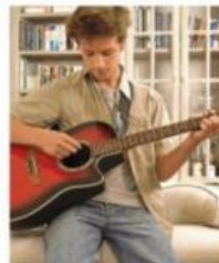
10 play the _____