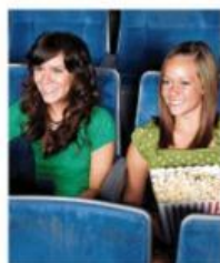
14 see a _____