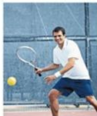
9 _____ tennis