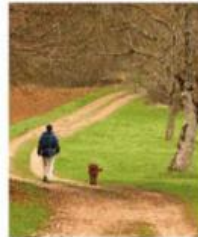
4 go out for a _____