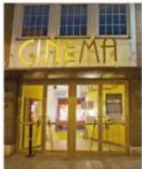
1 go to the _____

study book (my) friends read time walk guitar movie TV dinner watch play radio listen running coffee movie relax