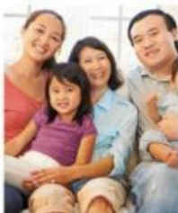
8 spend _____ with my family