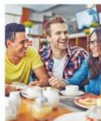
16 meet _____