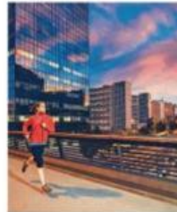
5 go _____