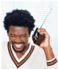
7 listen to the _____