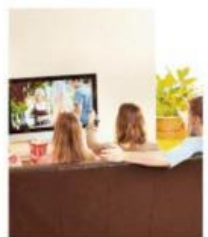
18 watch _____

What's your favorite activity? I play the guitar