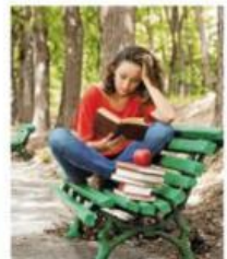
12 read a _____