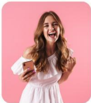
i) Cindy is _____.