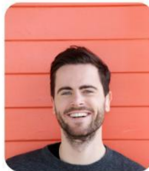
k) Ted is _____.