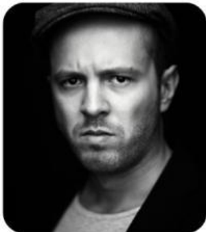
e) Oscar is _____.