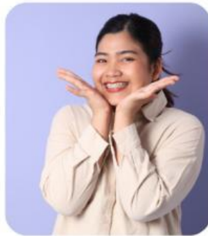
b) Margo is _____.