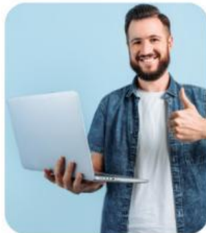
f) Felix is _____.