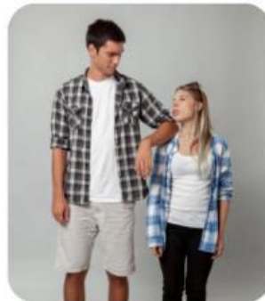
g) Jeff is _____.