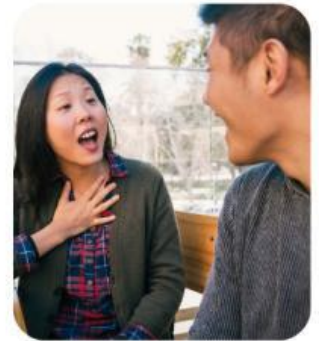
d) barb is _____.