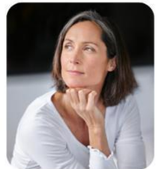
l) Laura is _____.