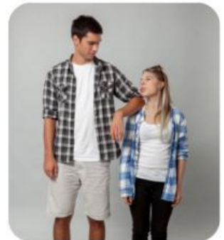
h) Alina is _____.