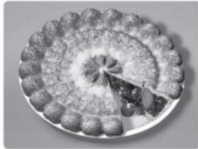
4 cherry _____