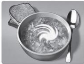
6 chicken _____

2 Think about dishes which are popular in your country. Write down: