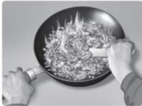
3 prawn _____