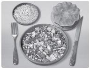
5 vegetable _____