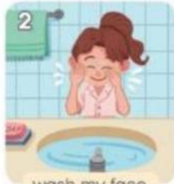
wash my face