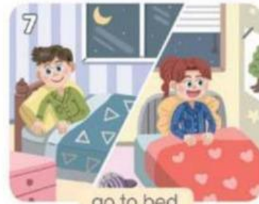
go to bed