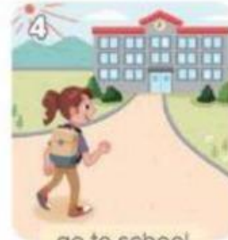
go to school