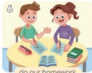
do our homework