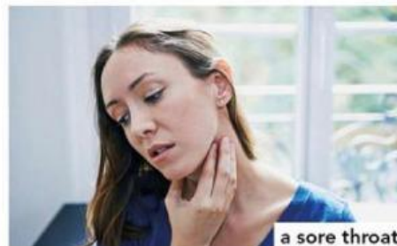
a sore throat