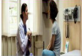
Primary care doctor