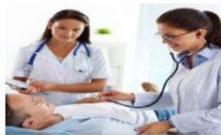
Internal medicine physician