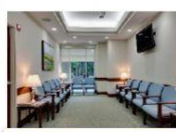
A waiting room