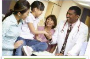
Family practice physician