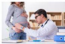
Obstetrician / gynecologist