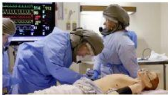
Infectious disease doctors