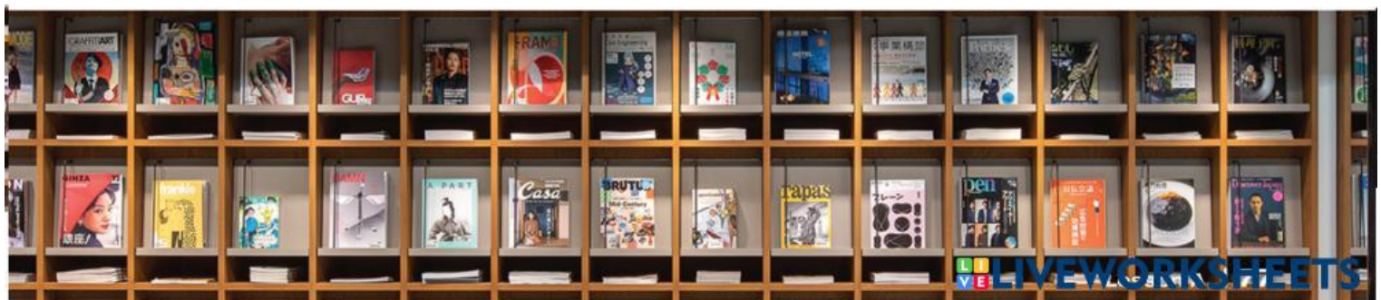
A bookshelf at Bunkitsu