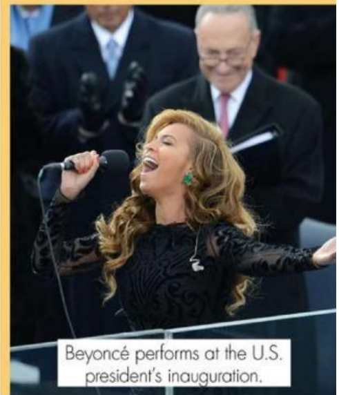
Beyoncé performs at the U.S. president's inauguration.

B Read the article. Then number these sentences from 1 (first event) to 8 (last event).