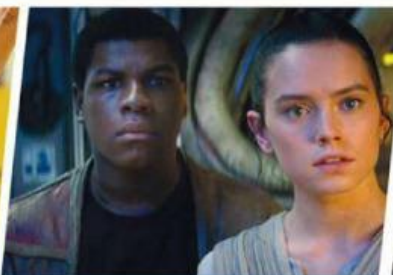
Star Wars: The Force Awakens