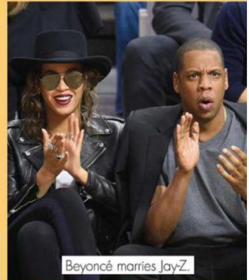
Beyoncé marries Jay-Z.

Many people talk about Beyoncé's energy on stage. She's an amazing entertainer. Millions of fans love her singing and dancing. Beyoncé uses many different styles of music, including funk, soul, and pop. In her career so far, Beyoncé has sold over 100 million records as a solo artist and another 60 million records with her group Destiny's Child.