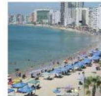
Salinas Beach is a really nice place.