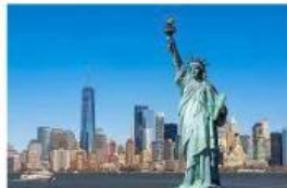
New York is a fairly expensive destination.