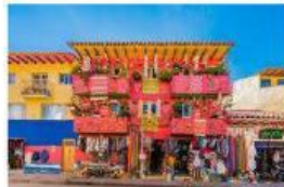
Villa Leyva is not a very big city.