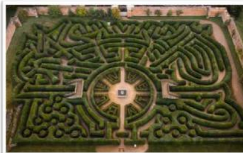
A MAZE* DESIGNER