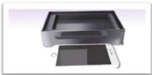
In front of