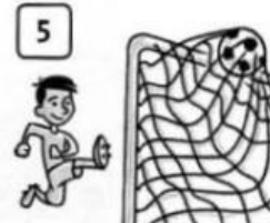
sc _ r _