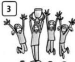
w _ _