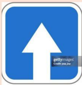
Up / Down