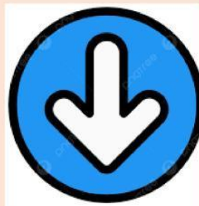
Up / Down