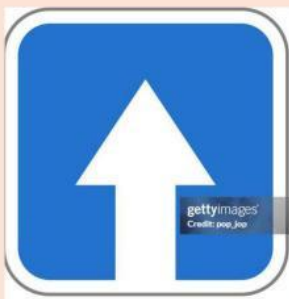
Up / Down