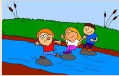
Across / Along