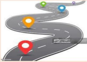
Across / Along