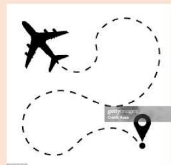
Around / Out