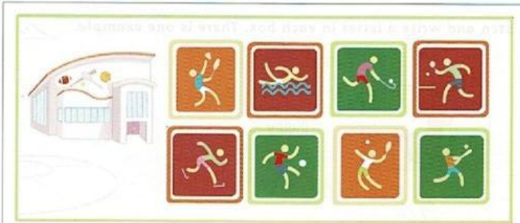
Going to the Sports Centre